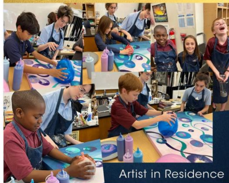
Artist in Residence