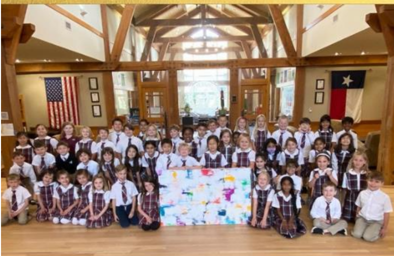
Artist in Residence