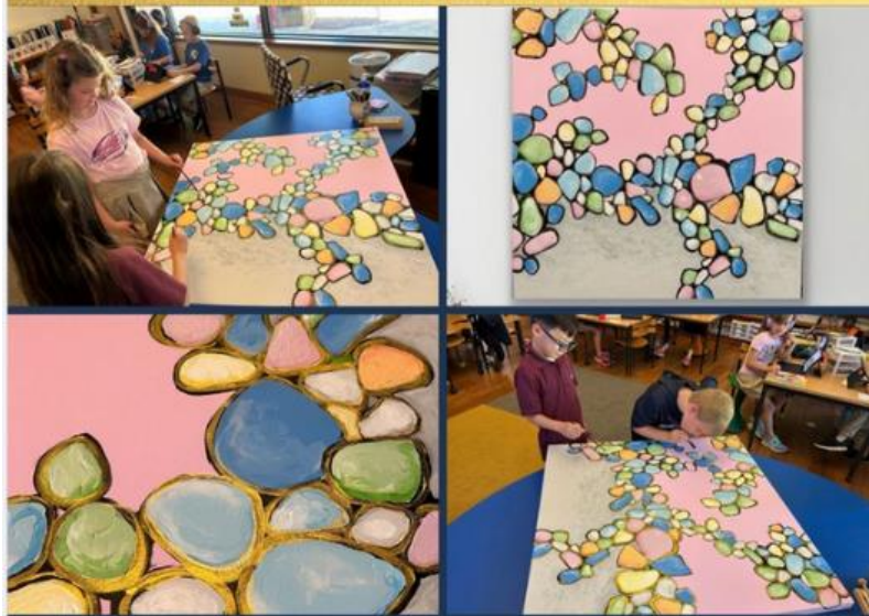
Artist in Residence