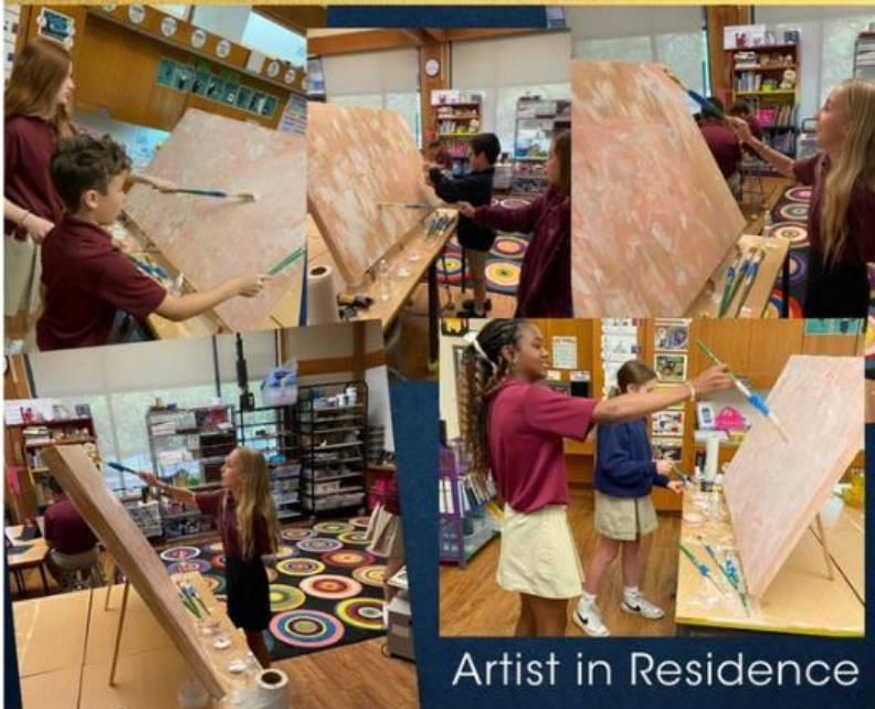
Artist in Residence